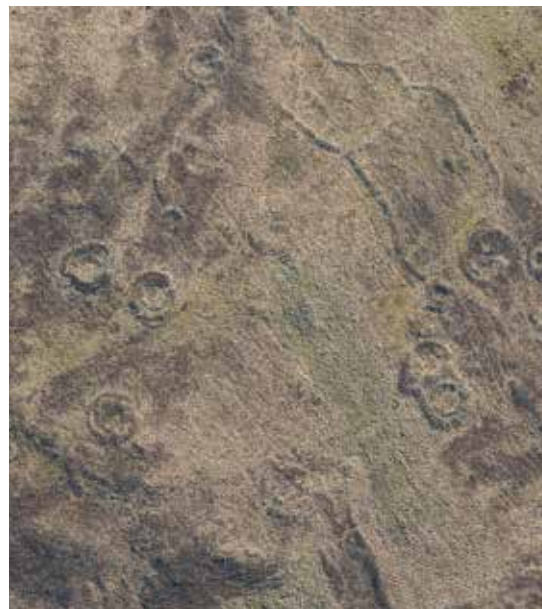
Left: This large group of roundhouses and cultivation remains extend across the south-west flank of Beddingrew, to the West of Drumturn Burn. At least twenty-two hut-circles and a platform can be identified.