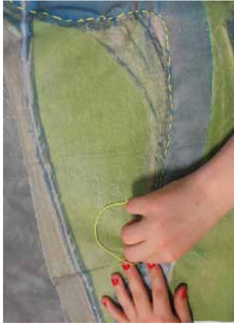
Left: Stitching the River Ercht, St Stephens Primary School