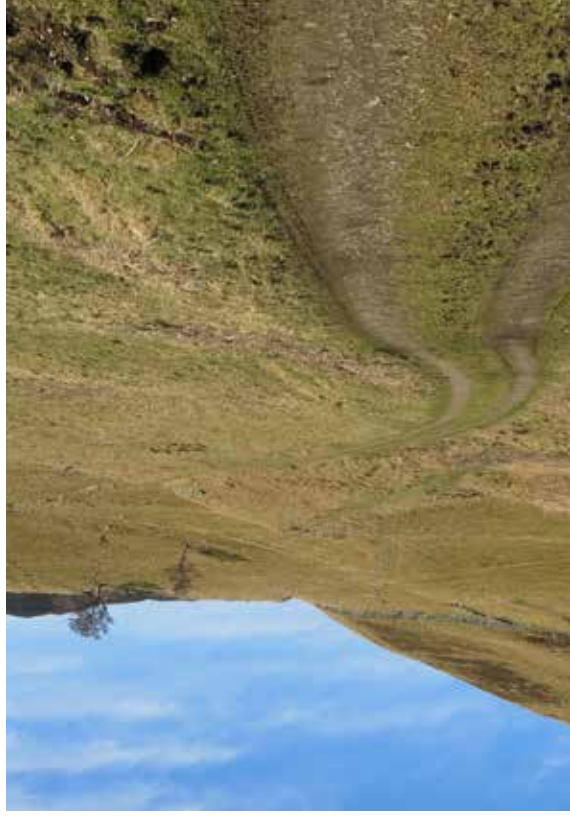
The path to Diarmuid's Grave

The many archaeological sites on the Cateran Trail provide interest for both walker and archaeologist and artist alike. Archaeological features in certain areas are more visible from the air than on the ground. Differences in ground surfaces caused by buried features can be viewed from the air and varying ground levels, soil, colour and texture provide not only information on new archaeological sites but both exciting colour and visual inspiration for creative activity for the many artists living around the Cateran Trail.