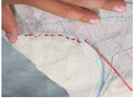
Stitching Red Stitch, St Stephens Primary School

Viewing their work appreciated by the community and in use in the local area fosters additional confidence and pride in local surroundings. It is particularly apt that two of the groups decided to make cushions which tie in with the idea of rest and a long walk. The new 'archaeological' textiles provide an opportunity to rest and contemplate their rich and diverse local archaeology and surroundings. Bunting allows the school and village an opportunity to celebrate their landscape and display their craft skills for many years to come.