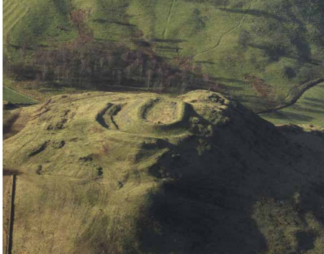
Above: The fort which crowns Barry Hill overlooks the mouth of Glen Isla and commands an extensive view across Strathmore. Barry Hill is impressive for the sheer scale of its defences which are both complex and multi-period, photo © Perth & Kinross Heritage Trust

Royal Commission on the Ancient and Historical Monuments of Scotland [RCAHMS] (1990) North-East Perth: An Archaeological Landscape . London: HMSO.