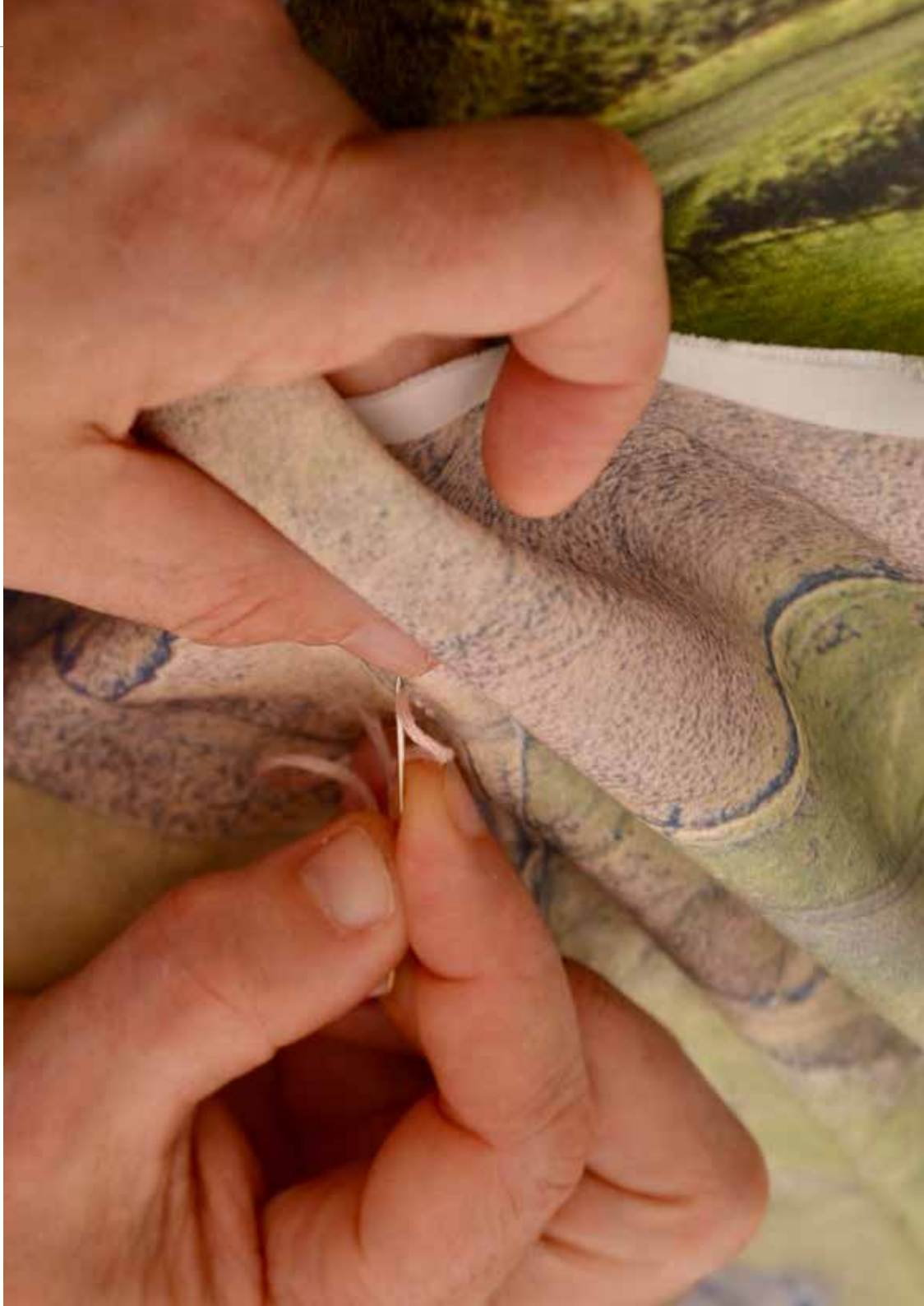
Left: Stitching the Trail at the Alyth & District Agricultural Show