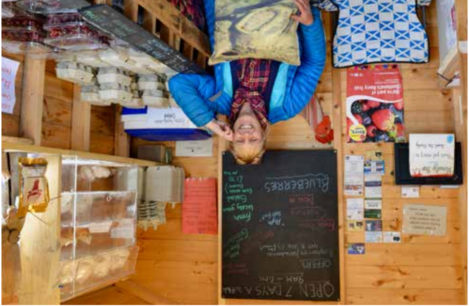
Above: Gifting one of the cushions to Marshalls Farm Shop, Photo by Clare Cooper