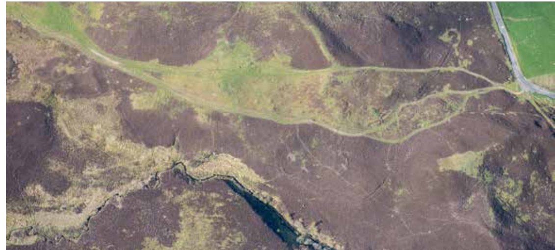
Top: This image was captured by a low-level small unmanned aircraft. It features Building #7 at Lair, Glen Shee, a medieval turf and stone longhouse, prior to its excavation as part of the Glenshee Archaeology Project in 2014, photo © Perth & Kinross Heritage Trust