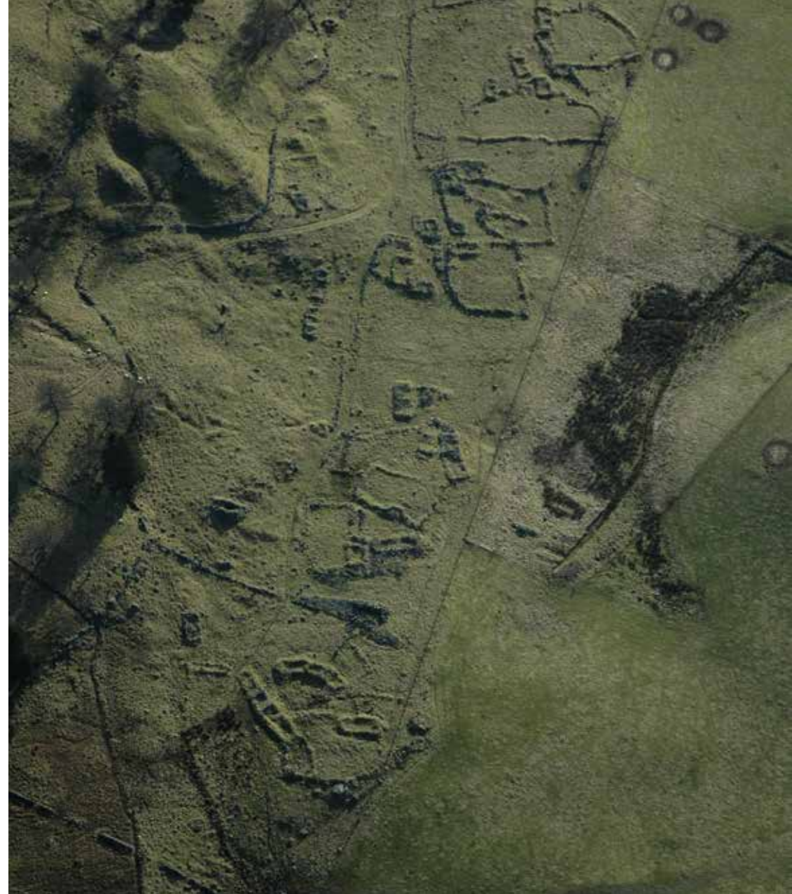
Above: Easter Bleaton is an exceptionally well preserved example of a linear post-medieval fermtoun settlement. The stone footing remains of at least fifty-two buildings together with a series of enclosures and four corn drying kilns can still be seen. From the disposition of the buildings it is possible to suggest the presence of at least eight different farmsteads, perhaps reflecting the properties of individual tenants, photo © Perth & Kinross Heritage Trust

Royal Commission on the Ancient and Historical Monuments of Scotland [RCAHMS] (1990) North-East Perth: An Archaeological Landscape . London: HMSO.