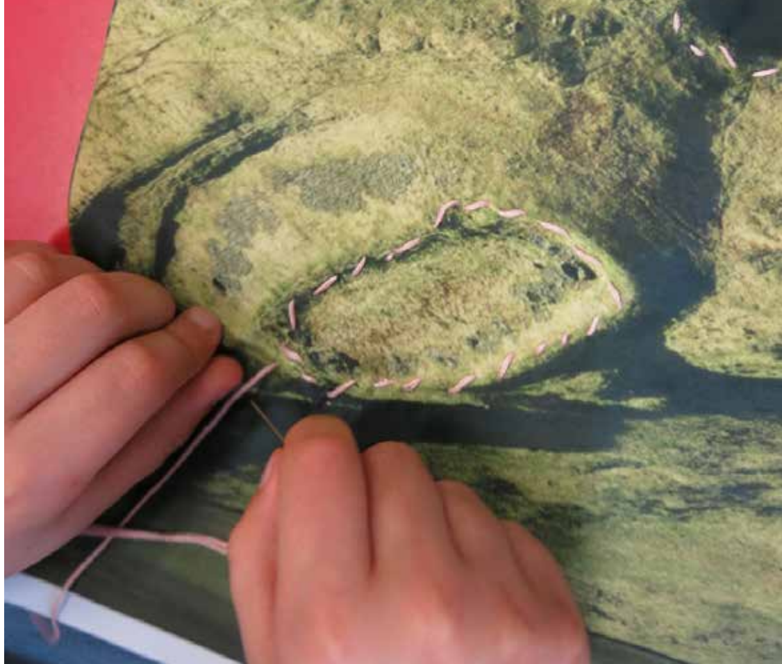
Stitching Barry Hill Fort, Kirkmichael Primary School, The fort which crowns Barry Hill overlooks the mouth of Glen Isla and commands an extensive view across Strathmore. Barry Hill is impressive for the sheer scale of its defences which are both complex and multi-period.